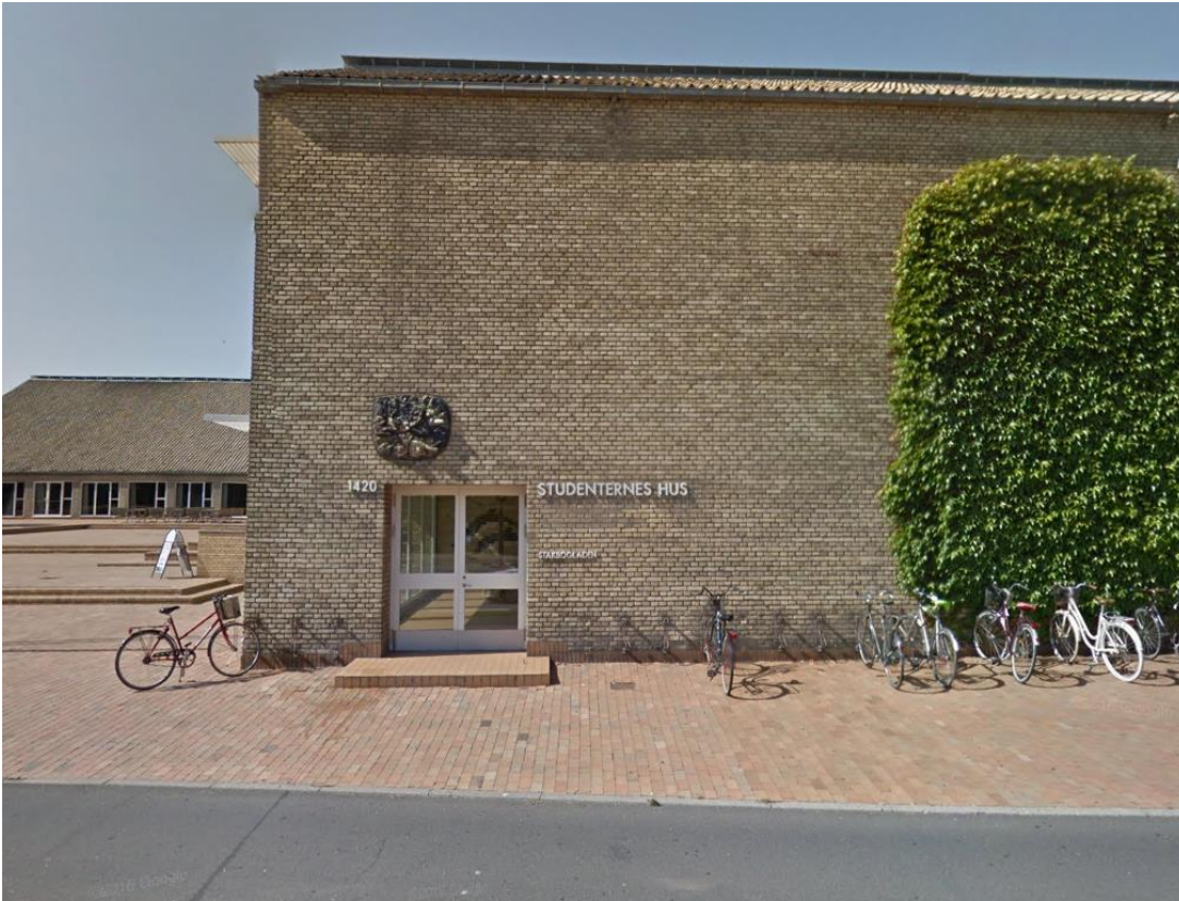
Entrance to Studenterhus Aarhus from Nordre Ringgade