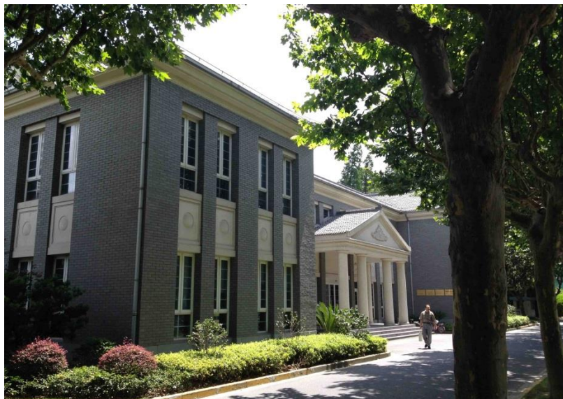
The Nordic Centre building